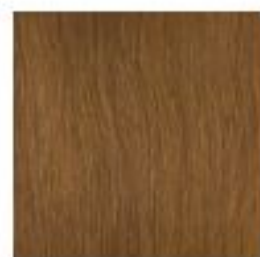
9G | Very Light Deep Gold Blonde