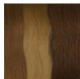
9.8G | Very Light Gold Blonde