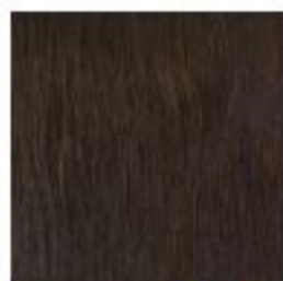
L5 | Light Brown