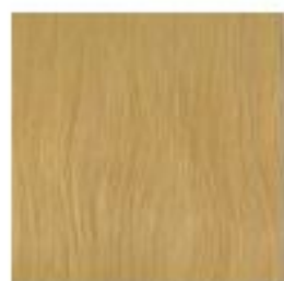
L10 | Super Light Blonde