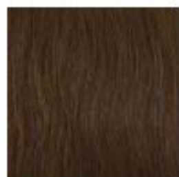
L6* | Dark Natural Blonde