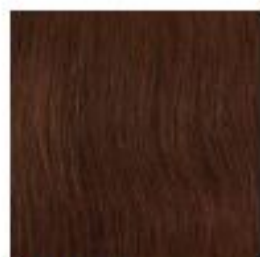
5RM* | Light Mahogany Red Brown