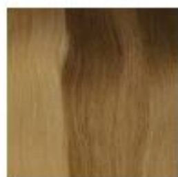
9G.10 OM* | Light Gold Blonde Ombre