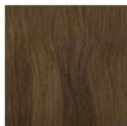
8A.9A | Light Ash Blonde