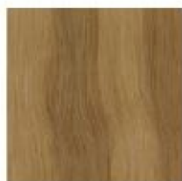
10G | Natural Light Blonde