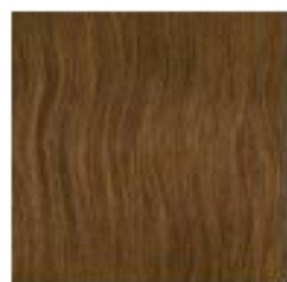
L8 | Light Gold Blonde