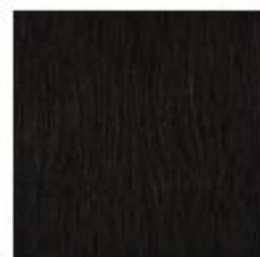
3 | Dark Brown