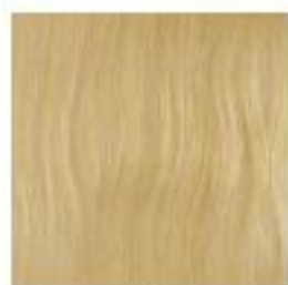
10A | Extra Super Light Ash Blonde