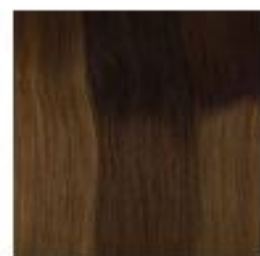
7G.8G OM* | Gold Blonde Ombre