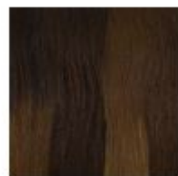
6G.8G | Dark Gold Blonde