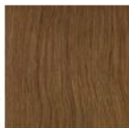
8A | Natural Ash Blonde