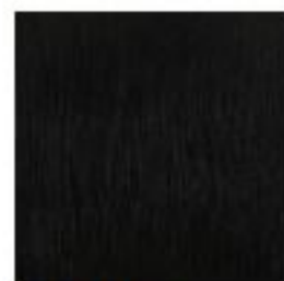
1 | Black