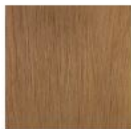
9A* | Very Light Ash Blonde